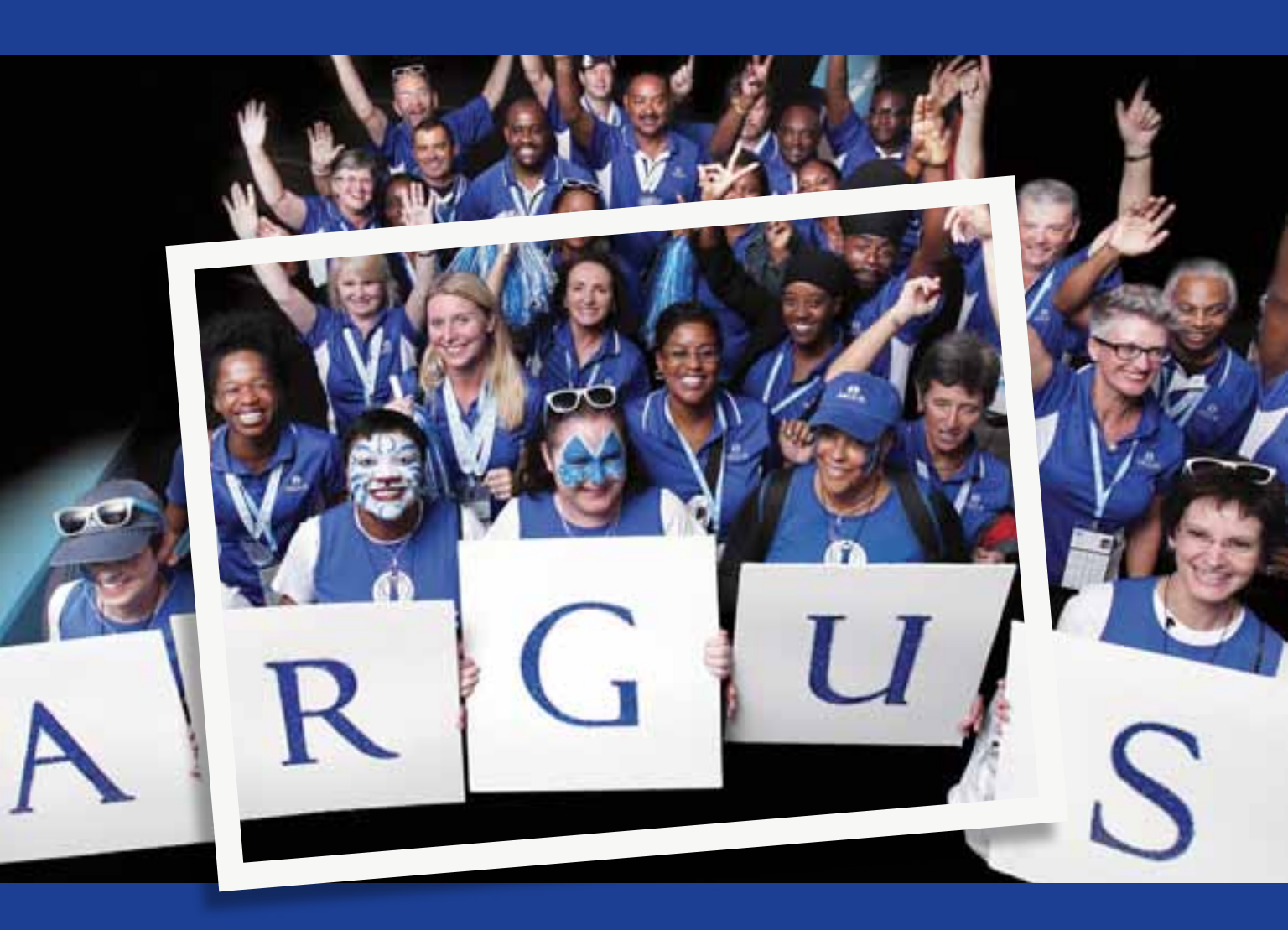
Going for Gold and Meeting the Challenge